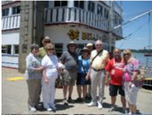
Gathering for a ride on the Belle of Louisville