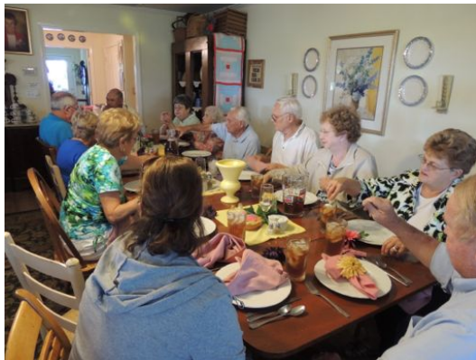
Lunch at Slow Poke Farm