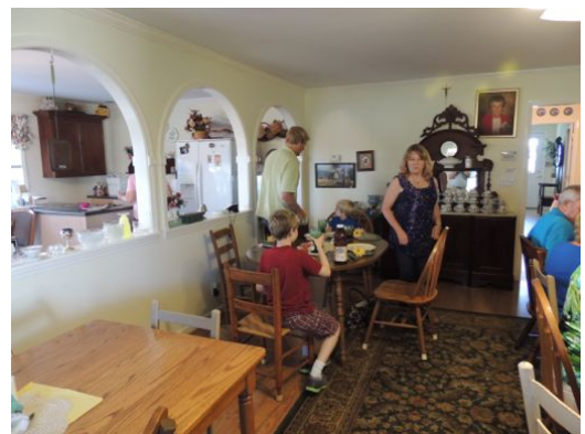
Lunch at Slow Poke Farm