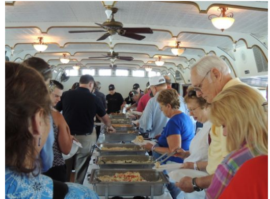
Buffet Lunch on the Belle of Louisville